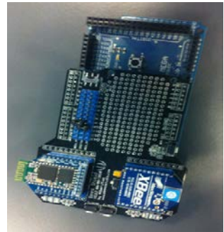
Figure 2. Arduino Uno with beeshielded Bluetooth and Xbee bee.

the received message to the other radio module. The tablet application sends messages that contain request for the tiles to change the game to another one, while the tiles send messages that contain the feedback of the game.