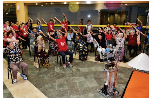
Fig. 3. RoboCoach.

On the contrary, on the side of what we will here call Active Assistive Robotics the production can be considered much more concrete. One example could be