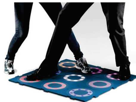
Fig. 4. Moto tiles – an example of an active tool for prevention and rehabilitation ( www.mototiles.com ).

In this context, we present our Moto tiles , robot tiles that light up when you touch them and that are mostly used to improve the balance of the elderly, and strengthen their muscles and endurance with a high grade of efficiency, as it has been demonstrated by scientific tests [11, 12]. Despite of their specific Medical Technology target and rehabilitative application, Moto tiles use can be easily translated in quite different contexts since they fulfil almost all of the typical criteria of the Universal Design Products. Their use is easy to learn. They are multimodal and can easily adapt to any kind situation, either indoor or outdoor, since they are very portable, reconfigurable and well fit to any context and user's age. Therefore, they might be used either as gaming or educational platform. More than that, they show their best when combining playfulness with fitness, rehab or educational exercises, all together. Besides, if compared with the mainstream assistive technology or medical technology products, they show their peculiarity in being a mostly "active" tool. Indeed, the software platform they use promotes users' motor and/or cognitive activation at the best and tends to adapt to the rate of users' responses in a fairly adaptive way.