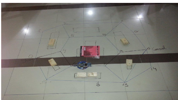
Fig. 3. Implemented Environment details

For the implementation of the path the environment under test was practically created. The created environment is shown in Figure 3. Figure shows the robot in given environment while navigating through the obstacles it starts from the point marked 0 and reaches to goal point 15 according to path generated by genetic algorithm. It first starts from 0 and reaches point 15 following the path created by points 0,4,6,7,9,15 respectively. Robot moves in two steps firstly it calculates the turning angle and then it moves forward and reaches desired point and this process is repeated for every movement from point to point.