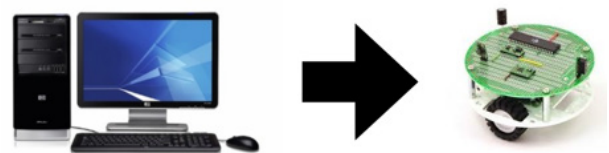
Fig. 1. Implementation Block diagram of Proposed Methodology

The algorithms used for static environments in this study are following: