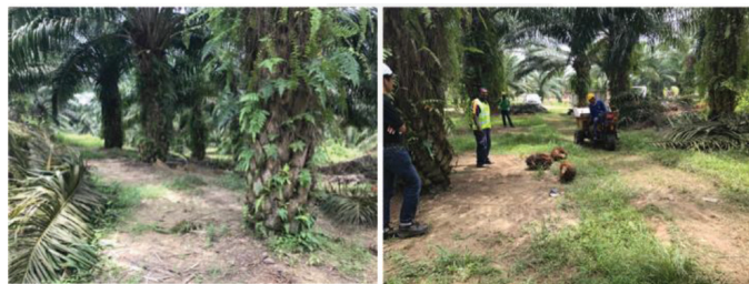
Figure 4 | The plantation and dropped fruit bunches in Sime Darby's plantation.