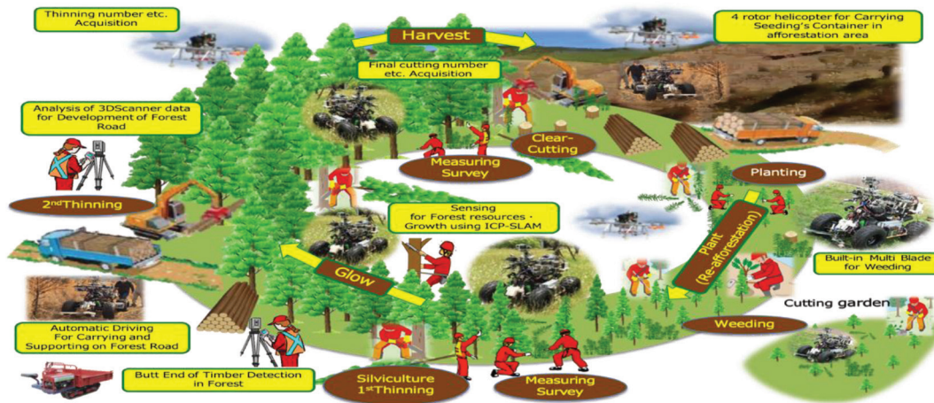
Figure 5 | The cyclical use of the forests as circulative resources.