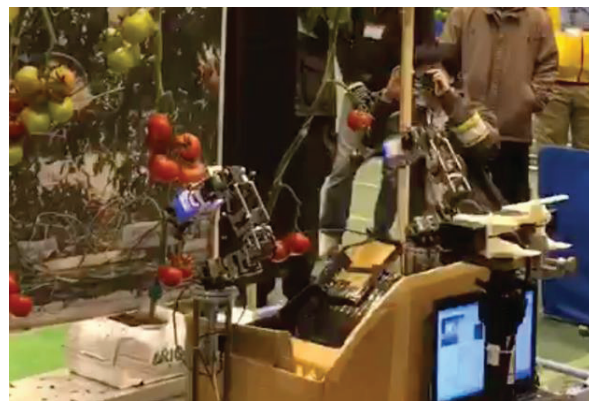
Figure 3 | The tomato harvesting robot picks a tomato. This robot can pick one of the tomatoes around 20 s.

The robot [11] has to be aimed autonomously 2–2.5 h/task (including traveling time), depending on a terrain and weather. If such robot can achieve, dozens of work rate and people would be reduced and provided more efficient to the plantation.