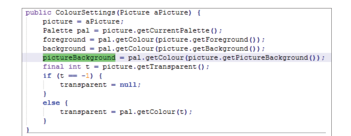
Figure 3 | The code of method ColourSettings.