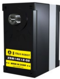
Fig.3. The appearance of the steering gear

The actuator of intelligent sorting and recycling machine is zsm14k12 steering gear. The working voltage of the steering gear is 9.5V-12V, the electrical standard of the control signal is 5.0V TTL signal, and the maximum working angle is 270°. Zsm14k12 actuator works fast and has stable performance. Its control mode can be serial control or PWM control. The actuator can quickly respond to the movement command of the system, and transfer different kinds of beverage bottles to the corresponding bin. The appearance of the steering gear is shown in the Figure 3.