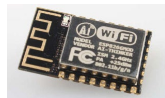
Fig.5. ESP8266 Profile Diagram

TCP is a link oriented and reliable protocol. It needs to wait for the confirmation of the receiver to establish a connection [2]. It is safe and reliable and can ensure data integrity. In this system, the esp8266 module uses TCP protocol to set the WiFi application mode of Esp8266 as sta mode and select TCP connection through at command, so as to realize the function of establishing data connection with ECS. The Esp8266wifi module is shown in Figure 5.